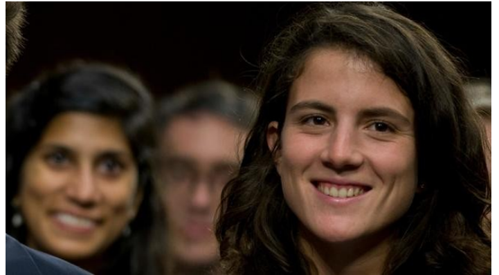
JFK's granddaughter Tatiana Schlossberg gets married (/news/nation-world/gallery/jfks-granddaughter-tatiana-schlossberg-gets-married)