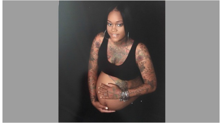
Police: Pregnant woman gives birth after being set on fire in Md., suspect arrested (/news/local/gallery/police-pregnant-woman-in-critical-condition-after-being-set-on-fire-suspect-arrested)