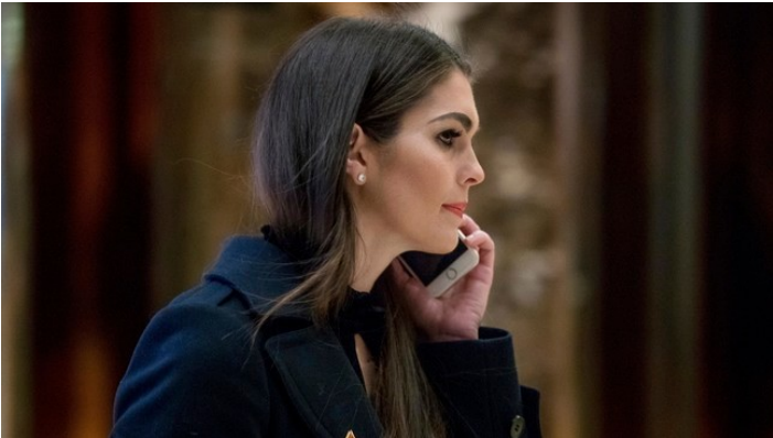
Report: Hope Hicks now permanent White House communications director (/news/nation-world/gallery/report-hope-hicks-now-permanent-white-house-communications-director)